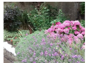
Maidstone West station garden