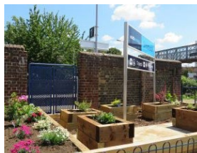
Five Acre Woods student garden