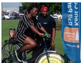
Isle of Sheppey smoothie bike pop-up