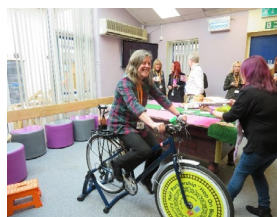
Pop-up Sheppey College