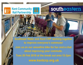
Pop-up Southern Water