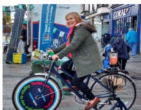
Maidstone CycleFest 2018