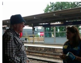
Rail safety week