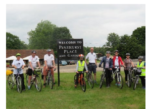
Family Bike Ride