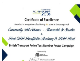
First place ACoRP award